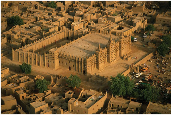
Great Mosque of Djenné

168. Great Mosque of Djenné. Mali. Founded c. 1200 C.E.; rebuilt 1906–1907. Adobe. (2 images)