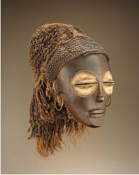
Female ( Pwo ) mask

173. Female ( Pwo ) mask. Chokwe peoples (Democratic Republic of the Congo). Late 19th to early 20th century C.E. Wood, fiber, pigment, and metal.