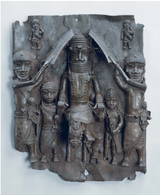
Wall plaque, from Oba's palace

169. Wall plaque, from Oba's palace. Edo peoples, Benin (Nigeria). 16th century C.E. Cast brass. (2 images)