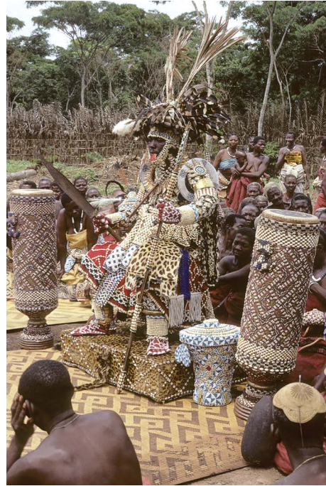
Contextual photograph: Ndop