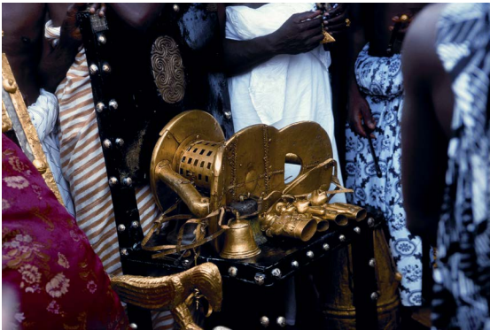
Sika dwa kofi

170. Sika dwa kofi (Golden Stool). Ashanti peoples (south central Ghana). c. 1700 C.E. Gold over wood and cast-gold attachments. (2 images)