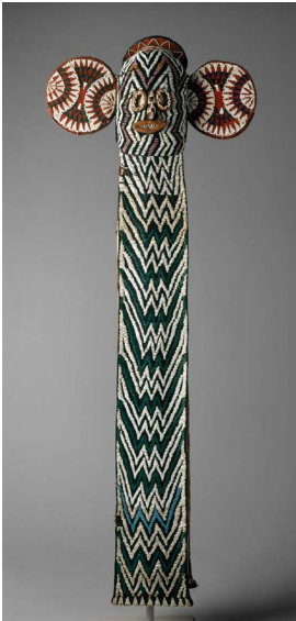
Aka elephant mask

178. Aka elephant mask. Bamileke (Cameroon, western grassfields region). c. 19th to 20th century C.E. Wood, woven raffia, cloth, and beads. (2 images)