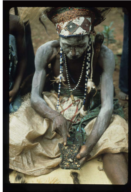
Contextual photograph: Lukasa