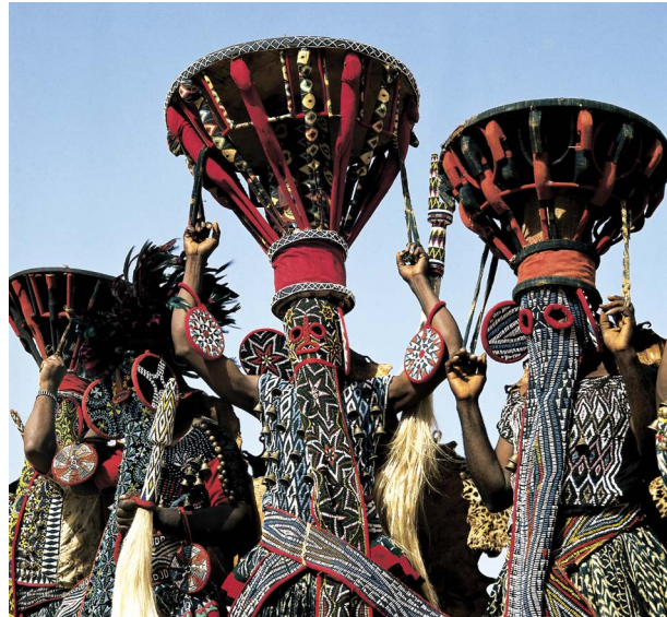
Contextual photograph: Aka elephant mask