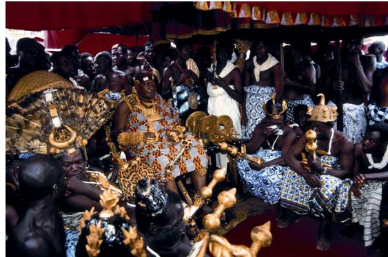
Contextual photograph: Sika dwa kofi