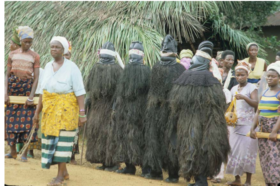
Contextual photograph: Bundu mask