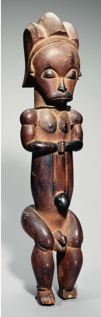
Reliquary figure ( byeri )