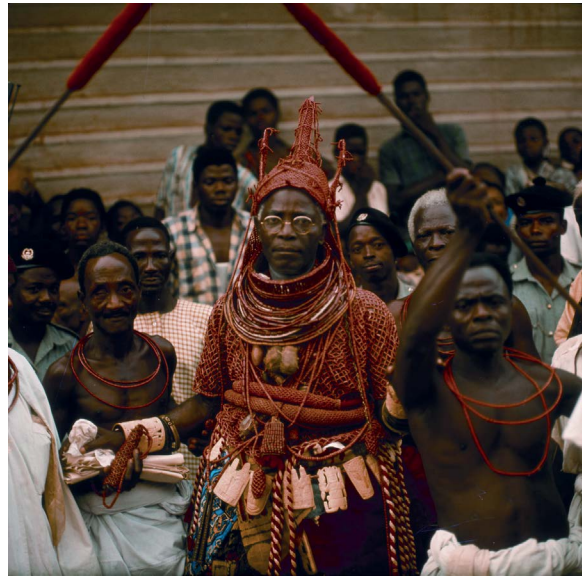
Contextual photograph: Oba of Benin