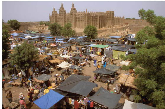
Monday market at the Great Mosque of Djenné